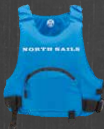
BUOYANCY AID 95 €