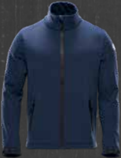
JACKET SOFTSHELL 205 €