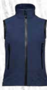
VEST 3L W 230 €