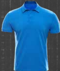
POLO JERSEY S/S 55 €