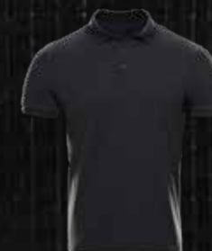
POLO TACTEL S/S MAN 68 €