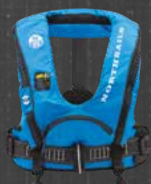
INFLATABLE LIFEJACKET PRO 195 €