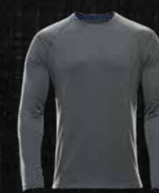
TECH T-SHIRT L/S 48 €