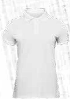
POLO PIQUET S/S W 52 €