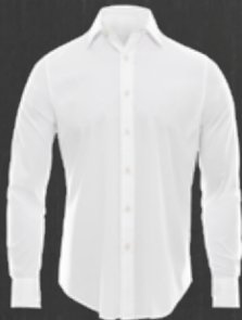
SHIRT L/S 78 €