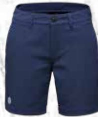
STRETCH SHORTS W 110 €