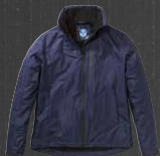
WINTER JACKET CREW MAN 230 €