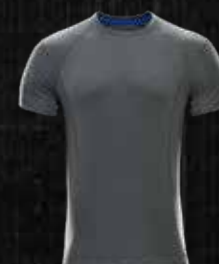
TECH T-SHIRT S/S 44 €