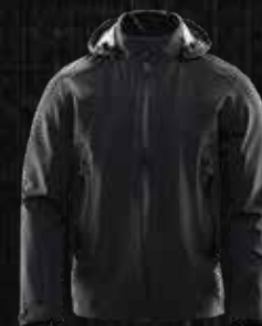
JACKET 3 LAYER 350 €