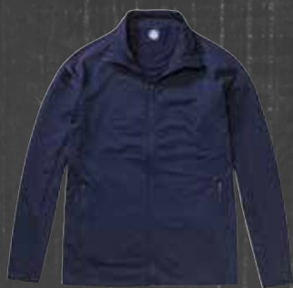
TECHNO FLEECE 95 €