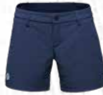
SUPER SHORTS W 110 €