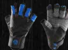
KEVLAR GLOVES 50 €