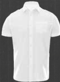
SHIRT S/S EPAULETTES 68 €