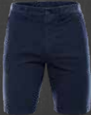
COTTON SHORTS 70 €