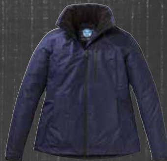
WINTER JACKET CREW WOMAN 220 €