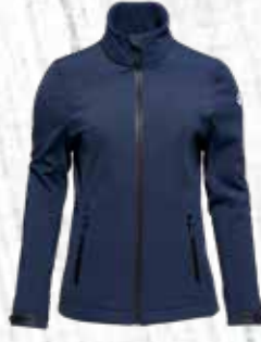
JACKET SOFTSHELL W 195 €