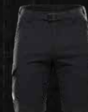
RACER SHORTS 145 €