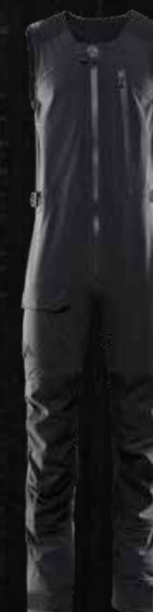
LONG JOHN 3 LAYER 380 €