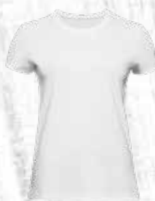
T-SHIRT S/S W 38 €