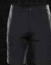
STRETCH SHORTS 110 €