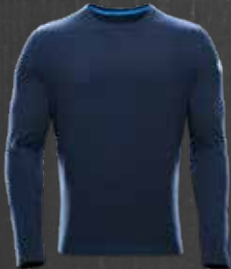
T-SHIRT L/S 42 €