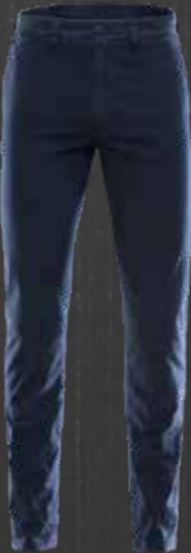
PANTS CHINO 85 €