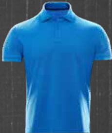
POLO PIQUET S/S 55 €