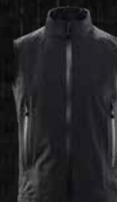
VEST 3 LAYER 240 €