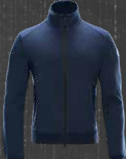
SWEATSHIRT 140 €