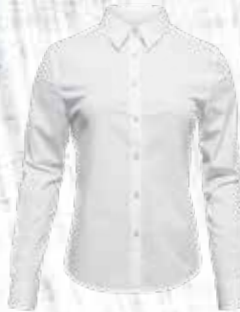
SHIRT L/S W 76 €