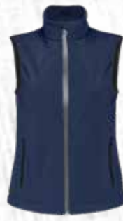
VEST SOFTSHELL W 150 €