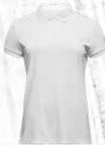
POLO TACTEL S/S W 65 €