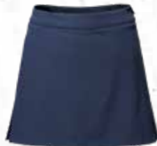
STRETCH SKORT W 110 €