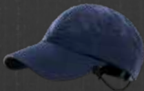
TECH CAP 32 €