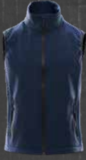
VEST SOFTSHELL 160 €