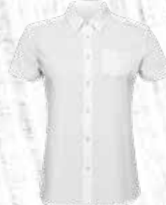
SHIRT S/S W EPAULETTES 65 €