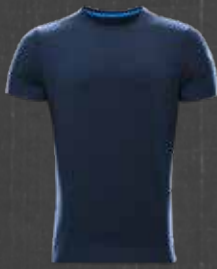
T-SHIRT S/S 38 €